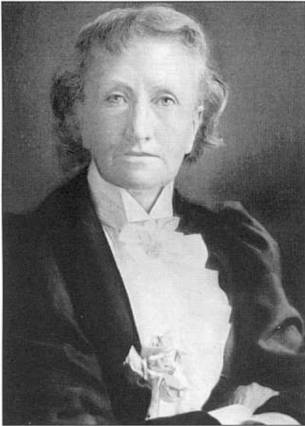
Dr. Jane Waterston c 1894.

in England, Jane Waterston's life has evoked much interest.