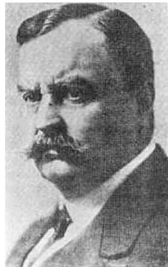
Dr David Bruce.

The increasing loss of cattle to nagana in Zululand during the 1890s forced the British government to take active steps to combat the disease. In 1894 Sir Walter Hely-Hutchinson, governor of Natal and Zululand, assigned Dr David Bruce to the task of determining the cause and cure for nagana. In a series of experiments during 1895 at the Ubombo magistracy in northern Zululand Bruce showed that the tsetse fly itself did not cause nagana but readily carried it from infected to healthy animals and that usually domestic animals bitten by the tsetse fly in a fly-infested area came down with the disease. He concluded that the tsetse fly transmitted nagana in nature. Even more important was Bruce's discovery of the organism that caused nagana viz. the parasite named trypanosoma brucei . 5