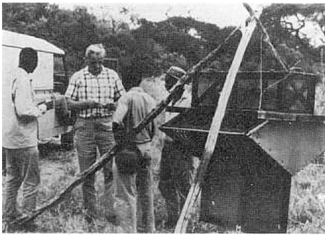
Examining the catch from a Harris fly trap.