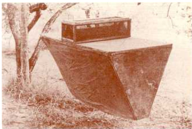
A Harris fly trap.

In April 1930 Harris began using a new type of fly trap in the reserves. His trap evolved from the fact that the tsetse