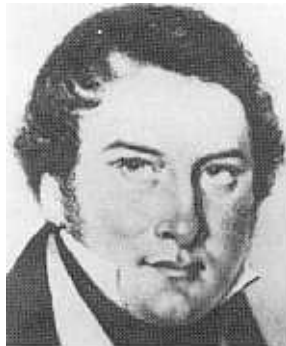
Right: F.G. Farewell (1793-1829).