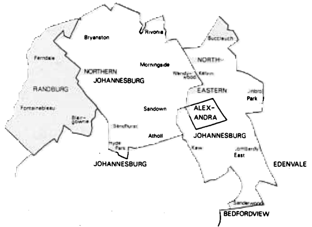
1959: The north-western Johannesburg local area committee gained independence as the Randburg Village Council. Alexandra Health Committee had been transformed into a local area committee in 1958.

autonomy taken by Randburg and Sandton, there were also a number of differences. The initiative for the establishment of Randburg came neither from the Board, nor from the Local Area Committee, not even from a residents' association, but from a self-appointed committee claiming to represent the views of the residents and supporting its claim with a substantial petition. 40