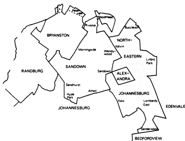
1961: The northern Johannesburg local area committee was divided into the Bryanston and Sandown local area committees and their northern boundaries were extended.