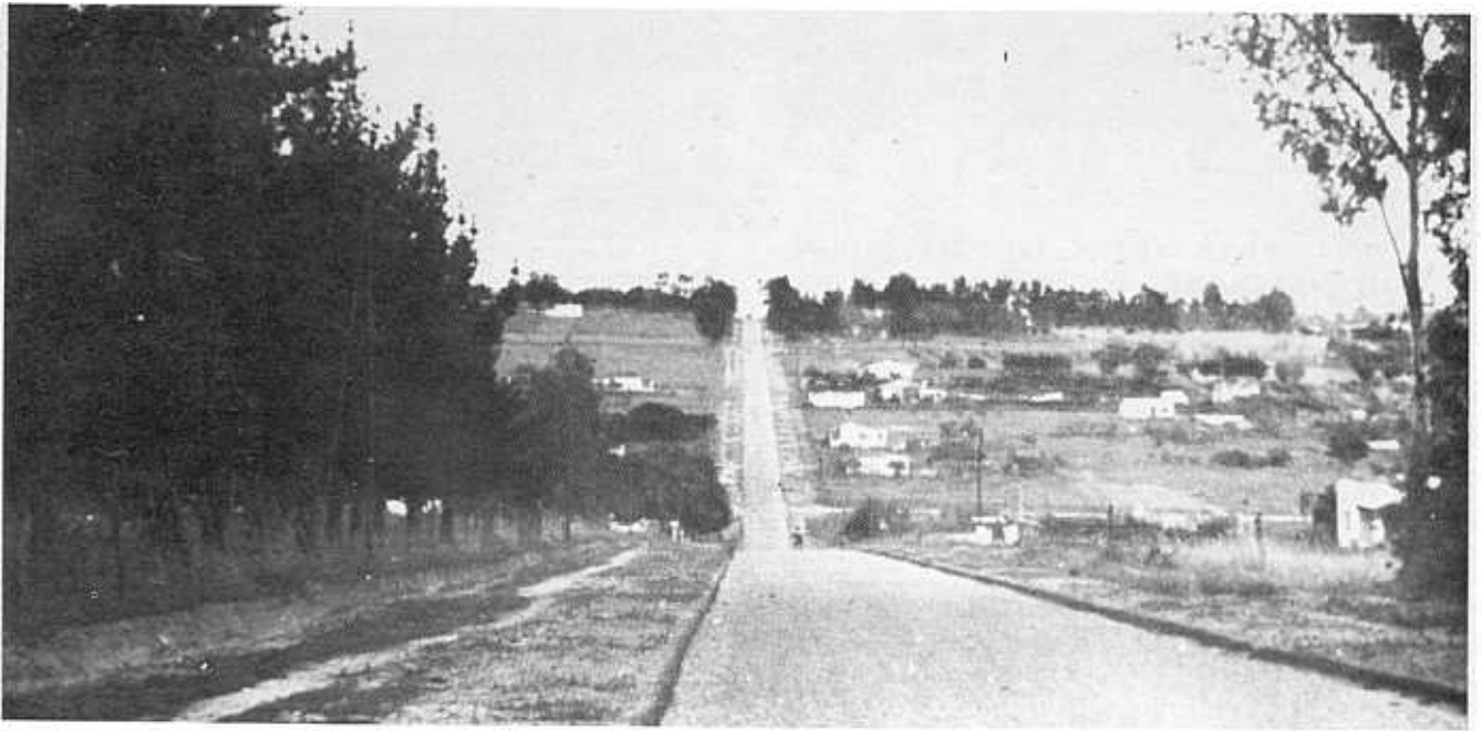
The main road Ferndale now called Hendrik Verwoerd Drive looking south (1953).