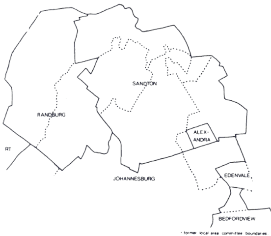
1969: The municipality of Sandton was created with some adjustments to the boundaries of Johannesburg, Bedfordview, Edenvale, Randburg, and Roodepoort. Alexandra remained a local area committee.

period the Board had to cope with unhappy residents who wanted some form of elected representation and who saw the Board as the stumbling block in achieving this. If elections had been held earlier, a large number of complaints about autocracy and over-centralisation might have been avoided.