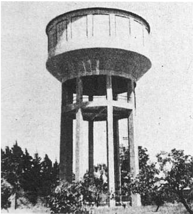
An important link in the Northern Johannesburg Water Supply Scheme: the Illovo water tower after completion in 1957.

Although there were similarities in the paths towards