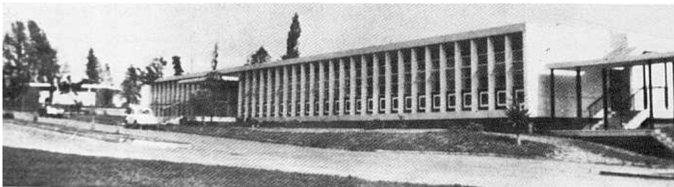
Begun in 1961, the Sandown Civic Centre now forms part of the Sandton administrative complex.