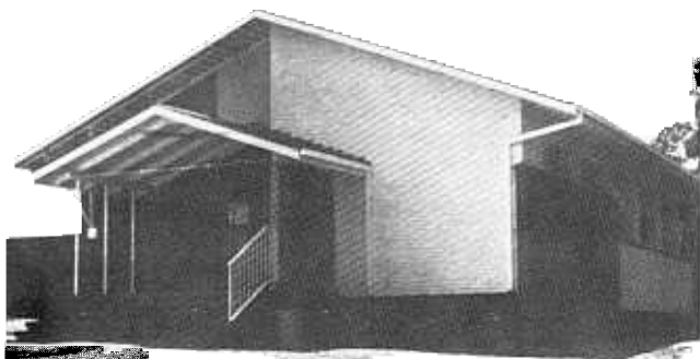
The Bryanston library which was completed on 15 December 1960.