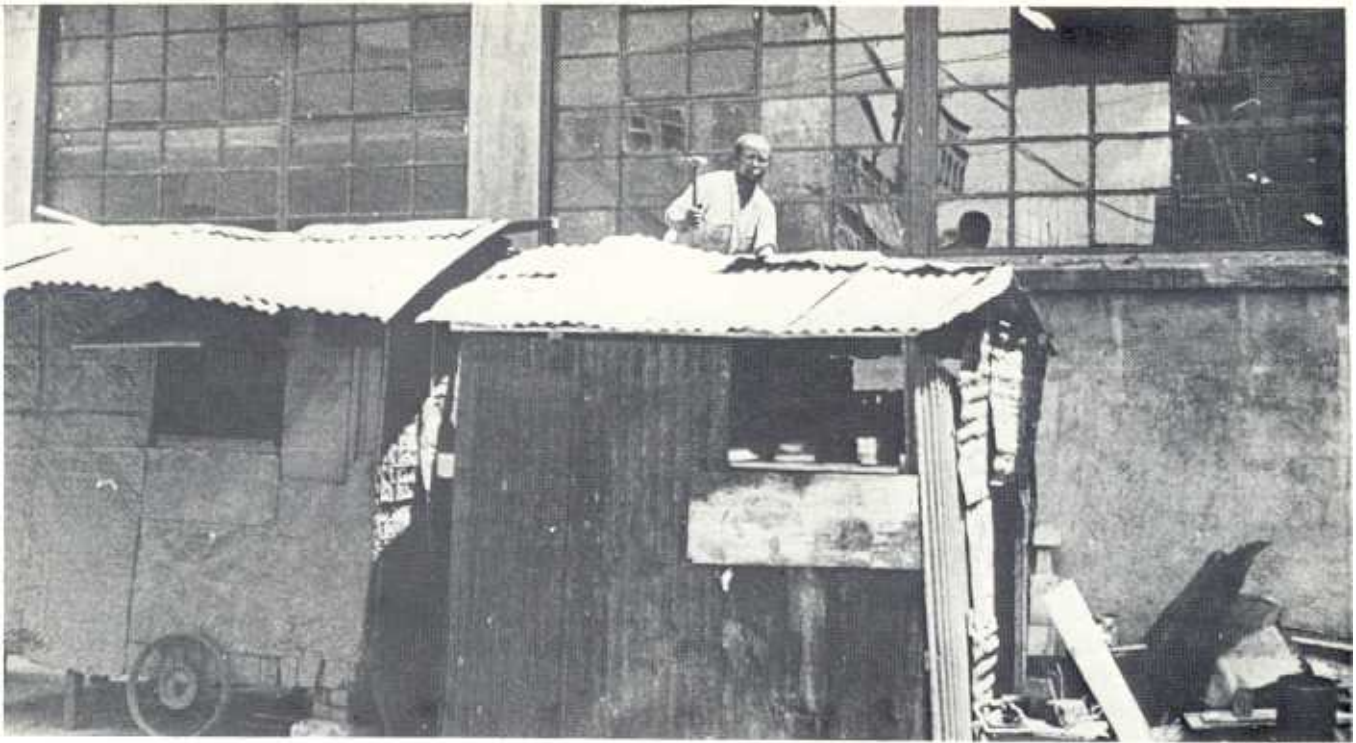
Plate 5 Construction of a new coffee-cart c. 1960. Note the non-functional wheel of the "cart" on the left.