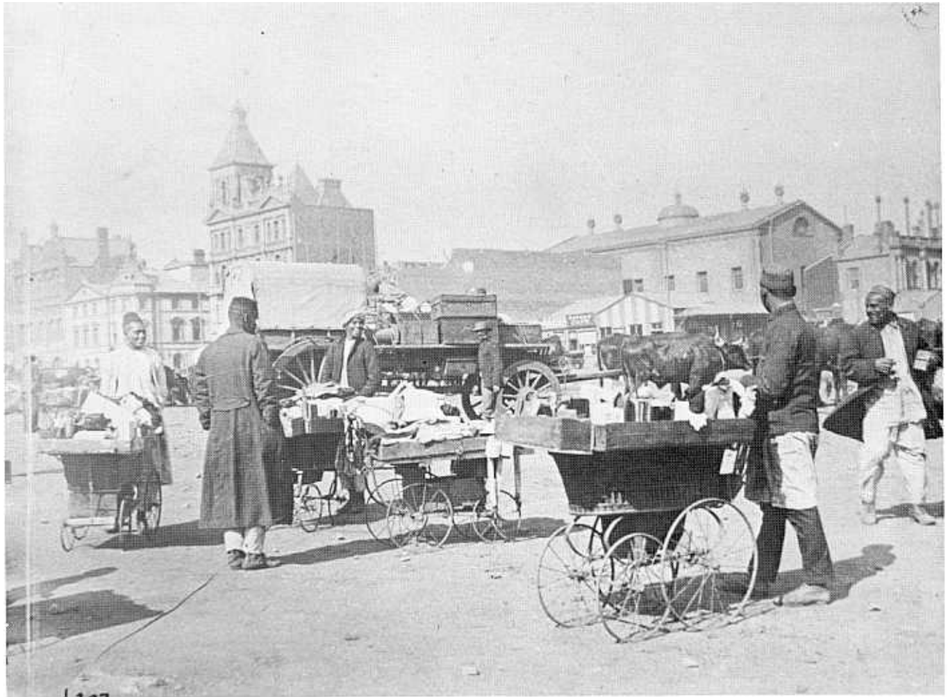
Plate 3 The barrowmen in Market Square, Johannesburg c. 1910.

nearly a century. Moreover, it also tends to support the thesis that there occur surges of 'popular' activities in the informal sector at different times. This, in turn, lends credence to the notion that people forced out of the income-earning activities possible and 'permitted' in one period will re-appear as people in a new niche discovered elsewhere in the informal sector.