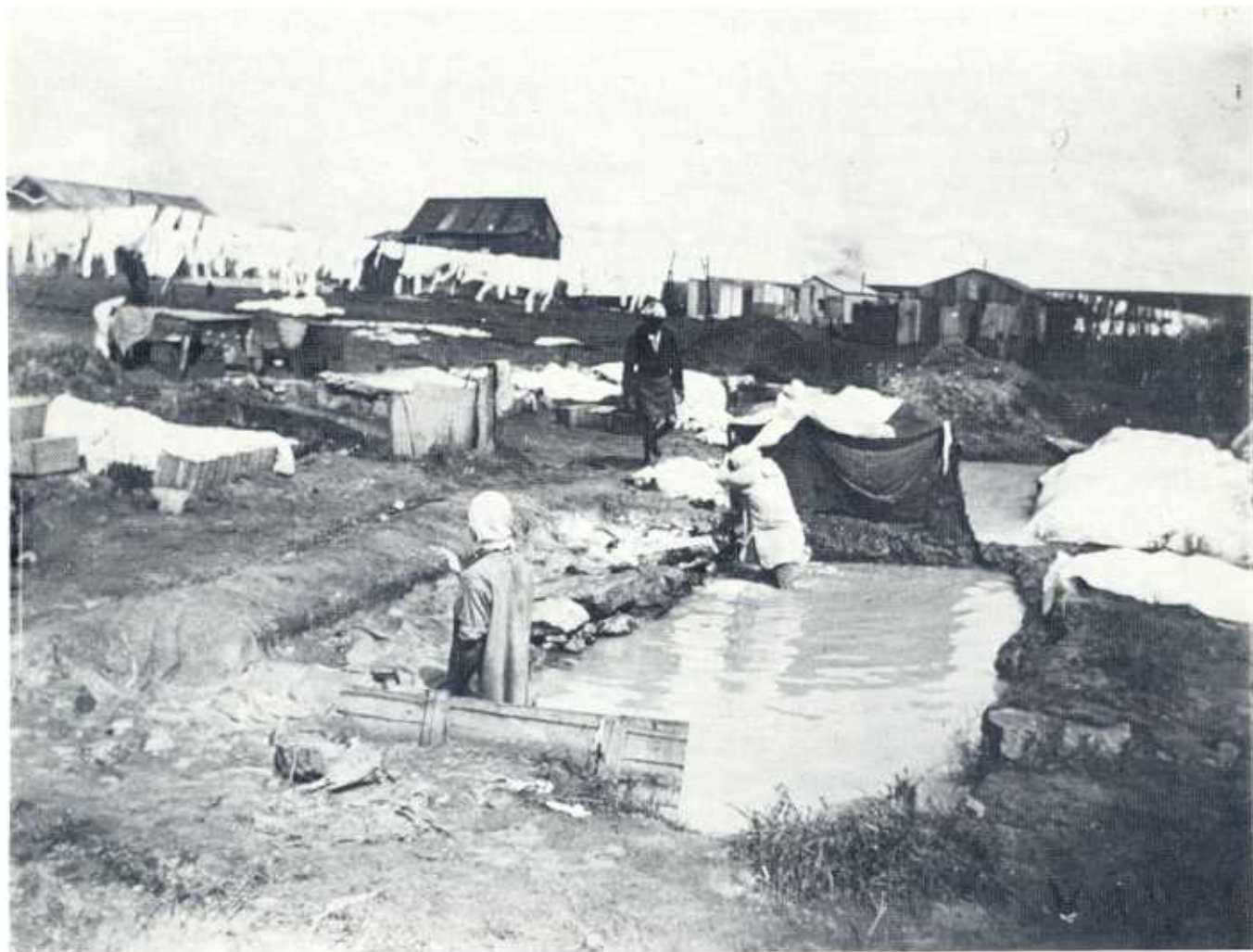
Plate 2 Washing - Newclare wash site c. 1910.

Once again, a lack of research material precludes a positive suggestion that those who participated in activities threatened or destroyed by their formal sector equivalents and its guardians would necessarily re-