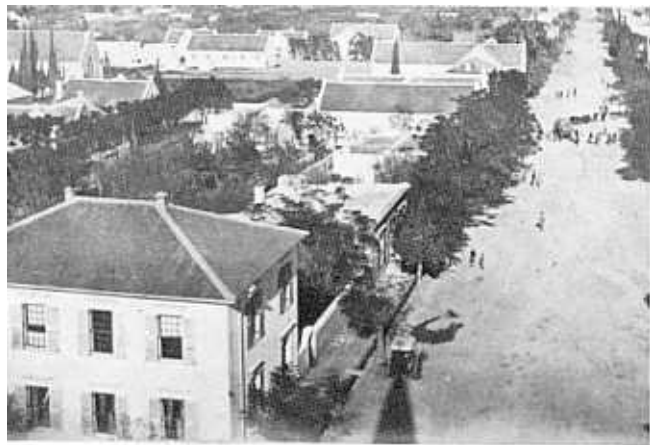
Church Street, Graaff-Reinet, c. 1860.

The founding of the drostdy did not automatically mean the simultaneous establishment of a town. But it did focus attention upon a particular point around which township development could occur. In this context the