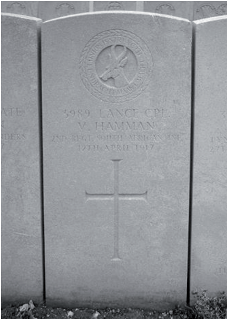
Image 5: Lance Corporal Vic Hamman’s grave in the Browne Copse Commonwealth Grave’s cemetery, Fampoux, France

Source: Commonwealth Graves Commission, “Find-War-Dead: V Hamman 5989” (available at http://www.cwgc.org/find-war-dead/casualty/567744/HAMMAN,%20V , as accessed on 31 May 2017).